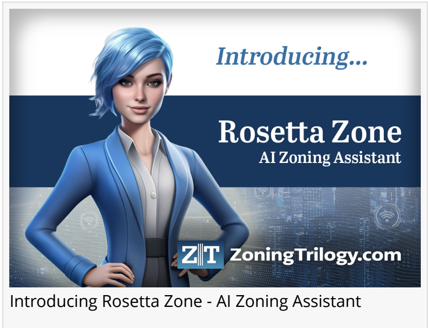
Introducing Rosetta Zone - AI Zoning Assistant

For over 30 years, the Zoning Trilogy has been a trusted resource for planners. A best-seller in the American Planning Association library throughout the 1990s, it moved online in 2003. Now in its seventh edition, it features over 2,000 zoning-specific definitions .