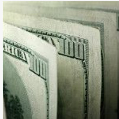
Houston business receivable factoring