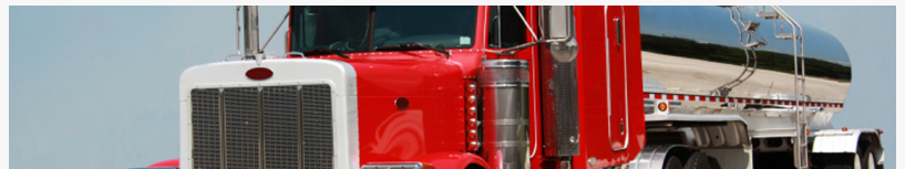
Houston freight factoring

HOUSTON, TX, UNITED STATES, May 20, 2025 /EINPresswire.com/ -- As technology continues to reshape industries and daily life, businesses across Texas—including sectors like transportation and freight—are adapting to both the opportunities and challenges presented by rapid digital innovation. For companies seeking financial solutions amid this evolving landscape, Gulf Coast Factoring and other Houston invoice factoring companies provide critical support to maintain cash flow and operational agility.