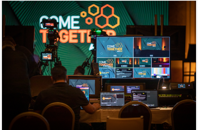
Corporate Event Photographer

Fast-Turnaround Photography for Business Events