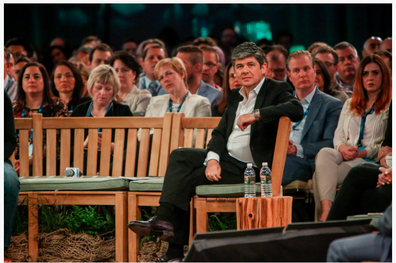
Tradeshow Photographer Las Vegas

Images can be delivered digitally via secure file transfer or directly to event staff for immediate use in branded communications. Common uses include: