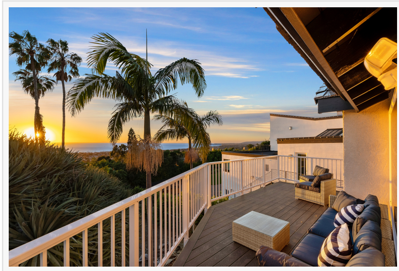
Oceans Luxury Rehab just steps away from the beach in Southern California

Located in the serene coastal environment of Orange County, the facility provides 24/7 compassionate care with a focus on privacy and