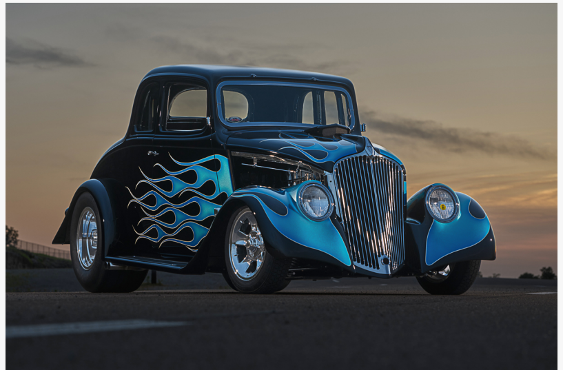
Congratulations to Dave Kroona and his 1933 Willys built by South City Rod and Custom for being named the Goodguys 2025 Tanks Inc. Hot Rod of the Year

To compete for this competitive award, vehicles must be older than 1948, show up to the event with a minimum of 500 miles on the odometer, and finish a 100+ mile reliability run through the scenic back roads of Tennessee, some of which were traversed in a downpour. Contestants also had to make a drag strip run at the conclusion of the day and the Willys completed it all with ease.