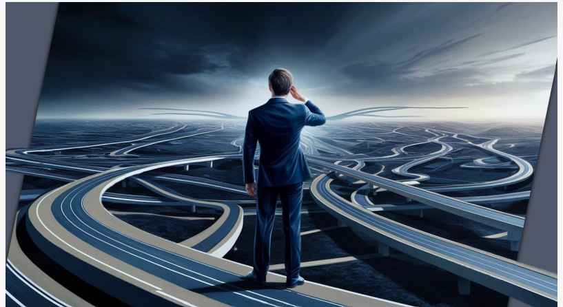
Charting the Future: New Roads of Opportunity for IT Leaders