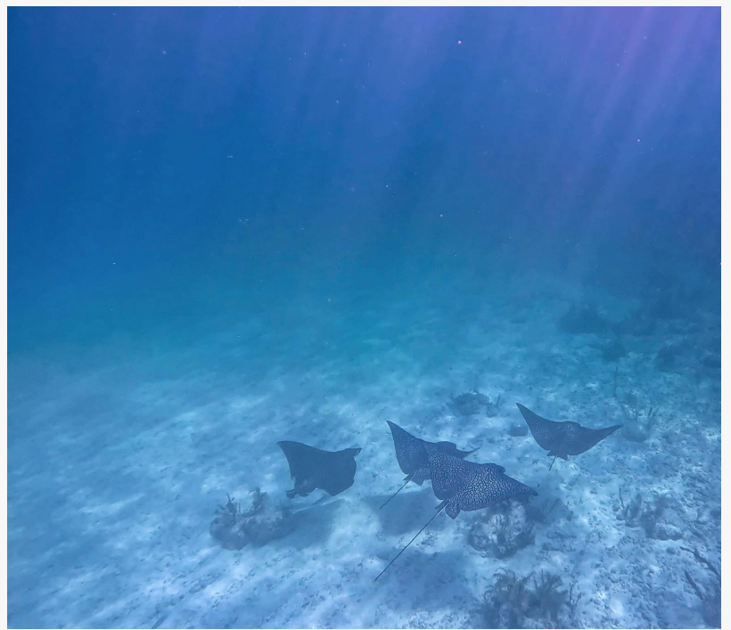
Fever of spotted eagle rays at Carysfort Reef At Carysfort lighthouse

Follow Silent World Dive Center on Instagram and Facebook for updates and exclusive offers!