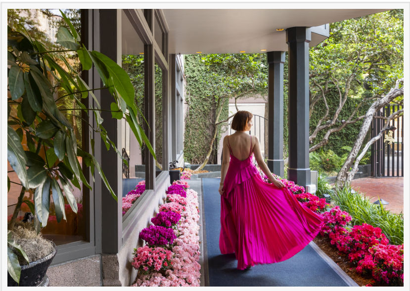
The Windsor Court