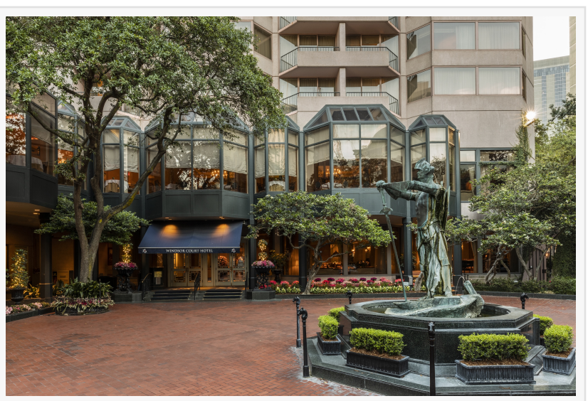
Entrance to The Windsor Court

The Windsor Court Media Contact The Mayfield Group THEWINDSORCOURT@MAYFIELDPR.COM