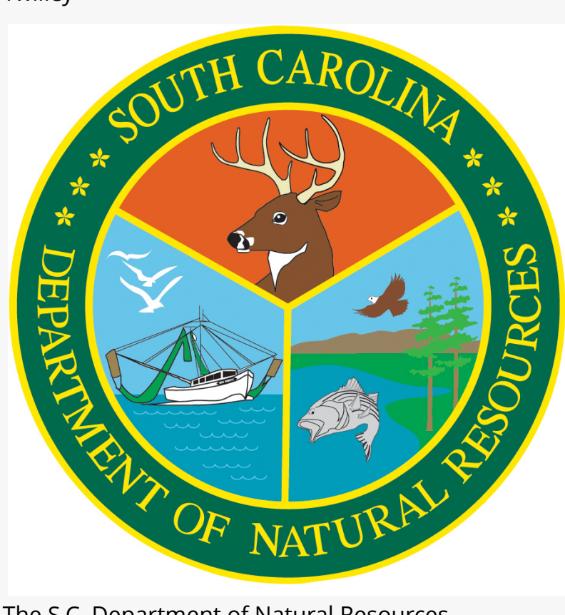
The S.C. Department of Natural Resources