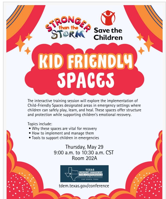
Stronger than the Storm - TX

Stronger than the Storm is a 501(c)(3) non-profit organization whose mission is to provide kid-friendly resources for youth, caregivers, educators, and the emergency management community that cultivates resilience and brings awareness to the specific needs of kids when planning for and responding to disaster events. Stronger than the Storm provides tools, builds awareness, and bridges the gaps between the nonprofit, education, government, and for-profit sectors, connecting people and best practices across the United States. Learn more at https://strongerthanthestorm.com .