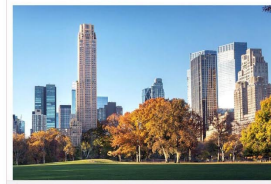
220 Central Park South Penthouse

$250M Penthouse at 220 Central Park South Will Officially Be NYC’s Most Expensive Apartment POSTED ON TALK MAG’S BLOG BY GWYNETH AUSTIN