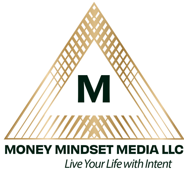
logo for Money Mindset