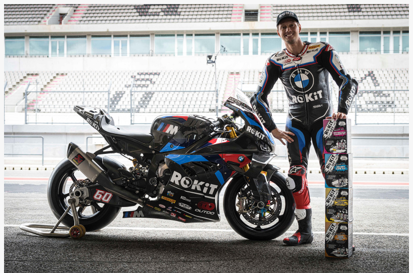
Michael van der Mark of the ROKiT BMW Motorrad WorldSBK Team

BMW Motorrad Motorsport and ROKiT are continuing to grow their strategic partnership with a key focus to have even more emphasis on the development of young motorcycle racing talent. Since the launch of their collaboration in 2023, numerous young riders have been able to gain valuable experience in a professional racing environment through the ROKiT