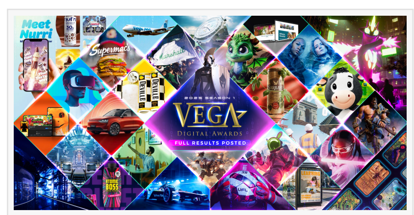
2025 Vega Digital Awards: Season 1 Full Results Announced

NEW YORK, NY, UNITED STATES, June 4, 2025 /EINPresswire.com/ -- The Vega Digital Awards is proud to announce the Season 1 Winners for 2025, marking a milestone as it celebrates its 10th anniversary. This season, the award witnessed an unprecedented response, with over 1,000 entries