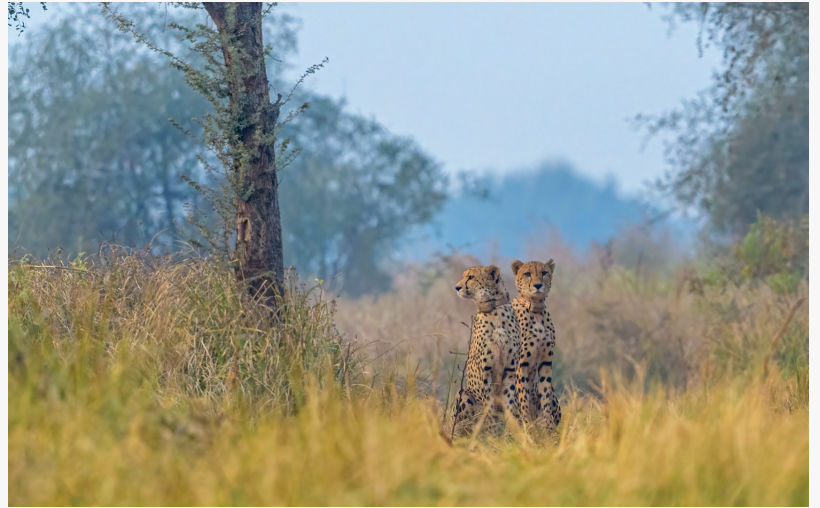
Cheetah's at Kuno National Park

This press release can be viewed online at: https://www.einpresswire.com/article/815060410