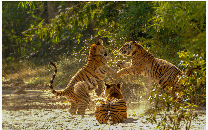
Bandhavgarh National Park known for Royal Bengal Tigers