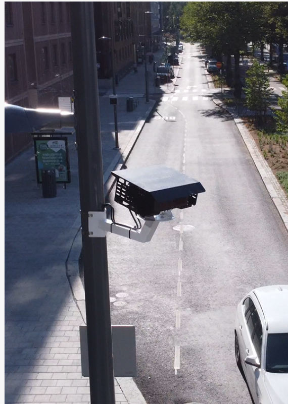
Seyond Falcon LiDAR Installed at Intersection