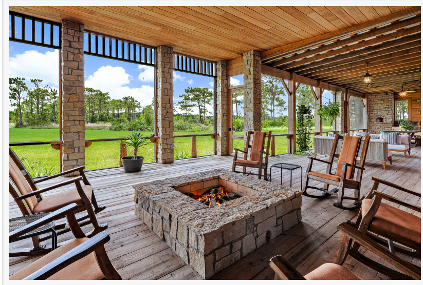
Nine-Bedroom Masterpiece on 40 Private Acres

Just over an hour from Palm Beach and close to Miami, PineHaven Sporting