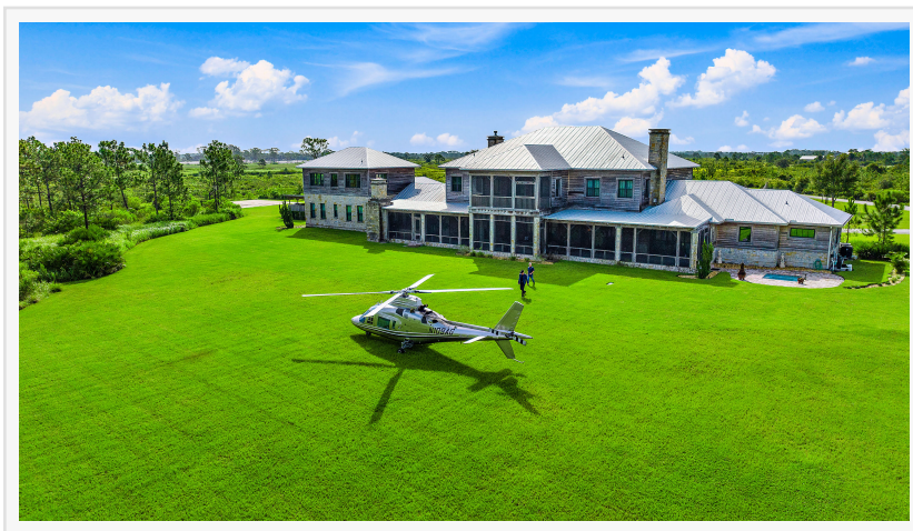
Primary Suite with Private Plunge Pool and Massive Closets

Agents will be compensated according to the terms and conditions of the Listing Agreement. See Auction Terms and Conditions for full details.