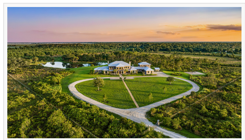
Adirondack-Inspired Estate in Exclusive Pine Creek Sporting Club

NEW YORK, NY, UNITED STATES, May 22, 2025 /EINPresswire.com/ -- Today, Sotheby's Concierge Auctions announced that bidding has opened for PineHaven Sporting Ranch, a stunning custom estate located within the prestigious Pine Creek Sporting Club, just 70 miles from Palm Beach. Spanning over 15,000 square feet on 40 private acres, the property will be