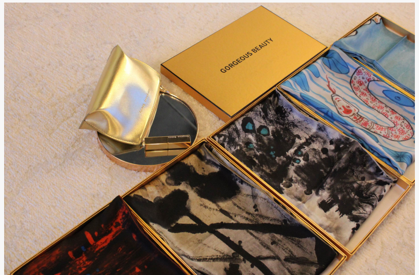
GOB merchandise at RelaXi Spring Wellness Gala

This press release can be viewed online at: https://www.einpresswire.com/article/815108280