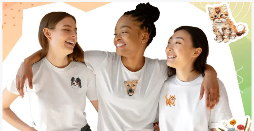
Tiuous | Custom Embroidered Pet Portrait Sweatshirt Hoodie