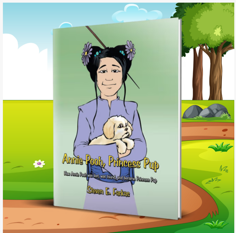
Annie Pooh, Princess Pup