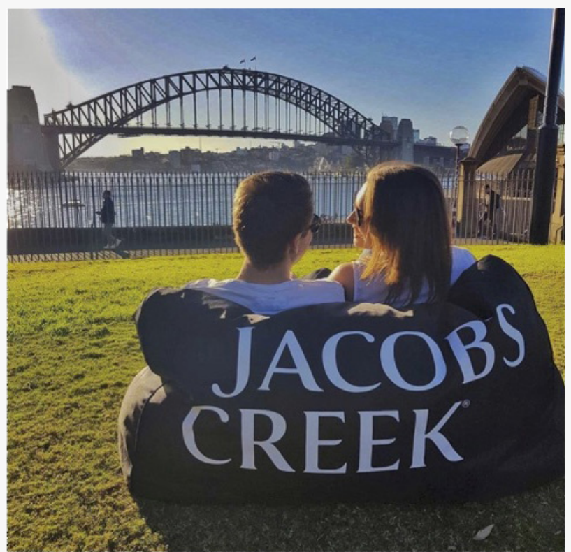
Jacobs Creek wines branded bean bag on Sydney Harbour