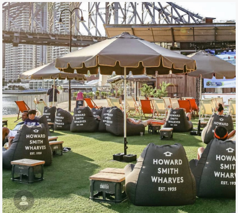
Branded Bean Bags at Howard Smith Wharves, Brisbane, Australia