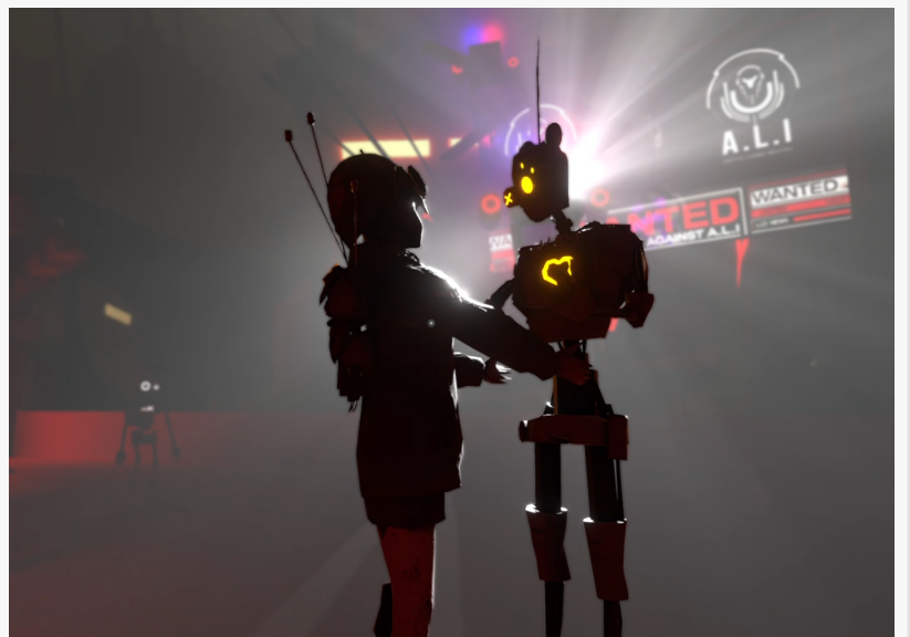
Gh0st and Atom share a moment under surveillance in Uncanny Alley: A New Day, a live VR theatre show by Ferryman Collective and Virtual Worlds Company.

With no stage separating audience from actor, participants are fully immersed within the performance, their voices and decisions impacting how the story unfolds.