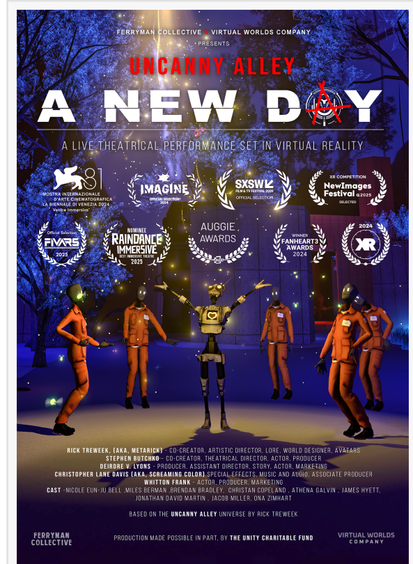
Promotional poster for Uncanny Alley: A New Day, a live VR theatre experience by Ferryman Collective and Virtual Worlds Company. Official selection of Venice Immersive, SXSW, NewImages and Raindance Immersive.

Set in a dystopian world where human connection has been fractured by control systems, the story follows Gh0st, a brilliant hacker, and her evolving AI companion, Atom, as they lead a group