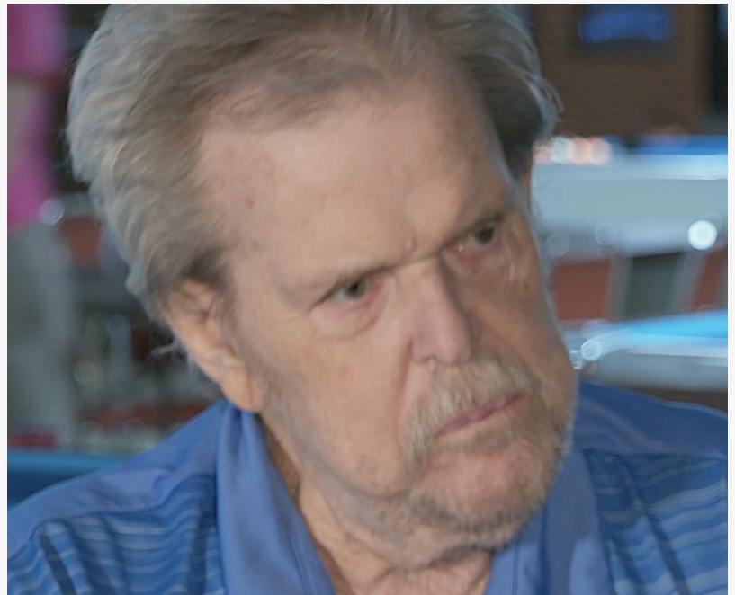
Buddy Hall on The Tale of Texas Pool set

Known throughout the pool community as "The Rifleman" for his pinpoint accuracy, Hall's career spanned over two decades of dominance in professional pool. His unmatched cue ball control and consistency in high-stakes "money matches" earned him a legendary status among players and fans alike.