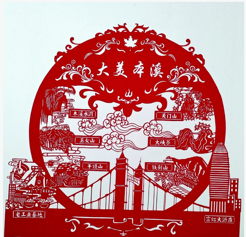
Benxi Manchu paper-cutting – Iconic landmarks of Benxi City