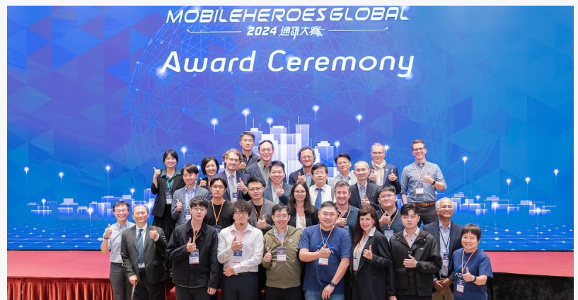
Top 9 finalists, and corporate sponsors in the 2024 award ceremony.