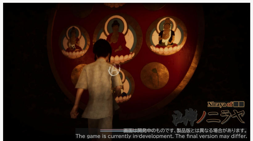
Niraya of 〇〇 2

Official website: https://hexadrive.jp/ (Japanese Only)