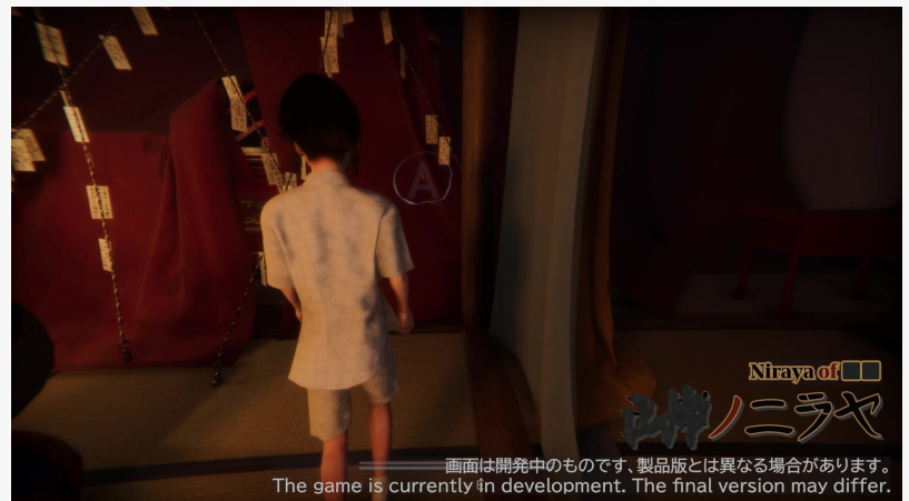
Niraya of 〆〆 1