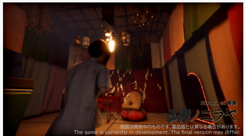
Niraya of 〇〇 4