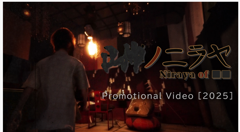
Niraya of 〆〆 main

New Promotional Video for "Niraya of 〆〆"