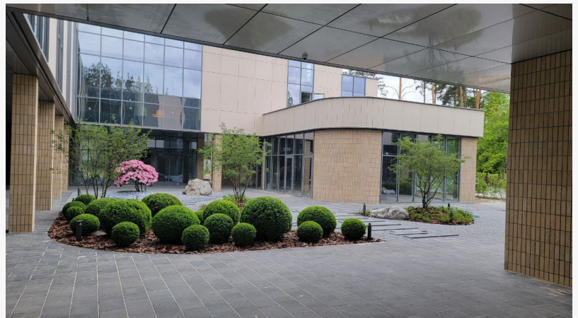
Holz Center opening soon