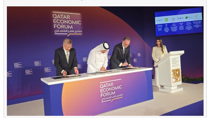
Signatories of the agreement

recognition of this initiative highlights its strategic alignment with the region's transition towards climate-conscious investment and cross-border collaboration.