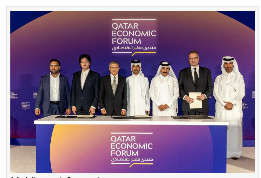
Multilateral Green Agreement

The agreement was signed at the Qatar Economic Forum, an annual platform convened by Bloomberg that has become a premier venue for announcing transformative partnerships in finance, energy, and global development. The forum's