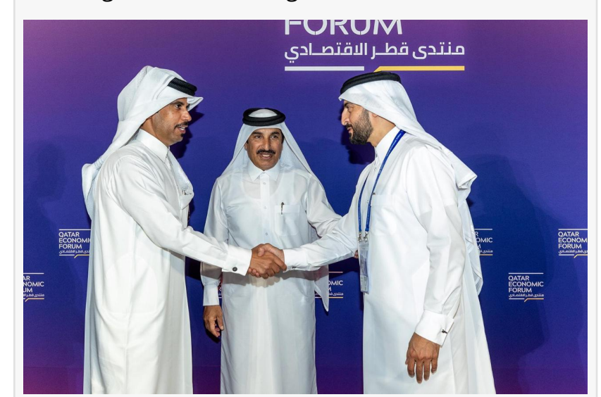
Multilateral Green Signatories