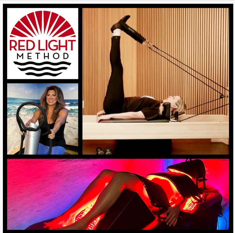
Red Light Method Modalities

In an industry that is constantly evolving and has no shortage of options what makes Red Light Method stand out?