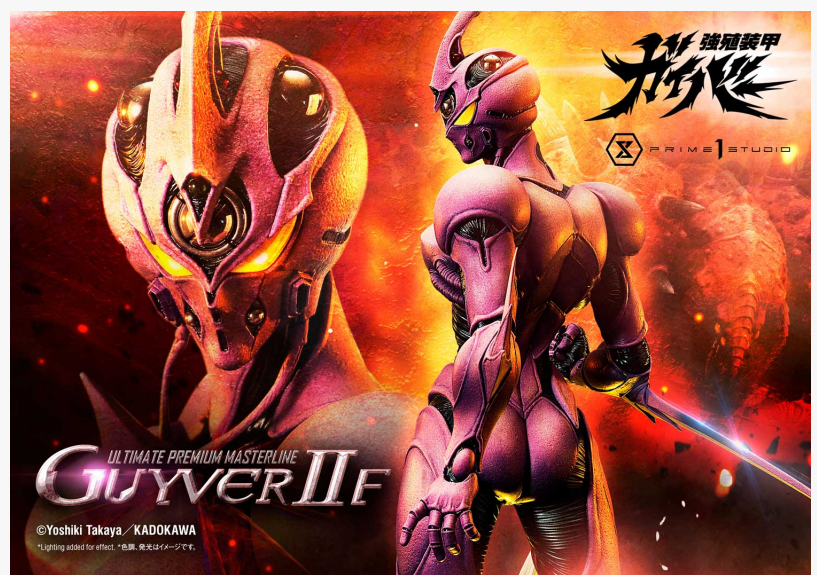
Ultimate Premium Masterline Bioboosted Armor Guyver Guyver II F(Female)

ASAKUSA, TAITO-KU, TOKYO, JAPAN, May 30, 2025 /EINPresswire.com/ -- To commemorate the 40th anniversary of the science fiction manga "Bio Booster Armor Guyver," first serialized in 1985 and created by Yoshiki Takaya, Guyver IIF(Female) has been brought to life as a statue in the "Ultimate Premium Masterline" series.