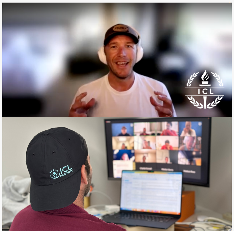
Bode Miller shares his story of grit and determination with ICL Academy students