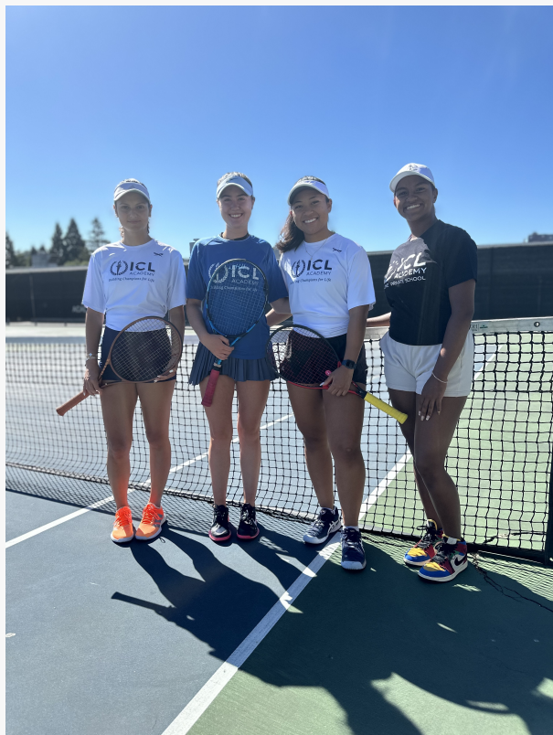
ICL Students Training Together