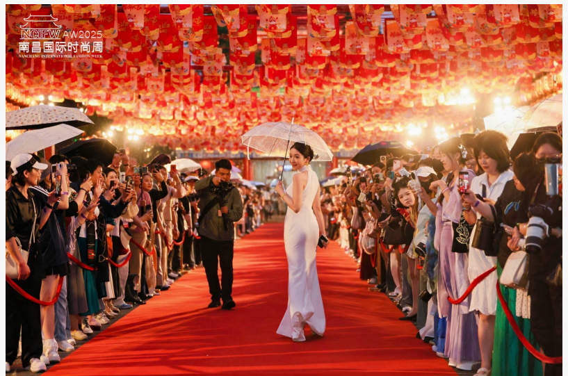
Nanchang International Fashion Week Concludes Perfectly, Bringing Fashion into Everyday Life