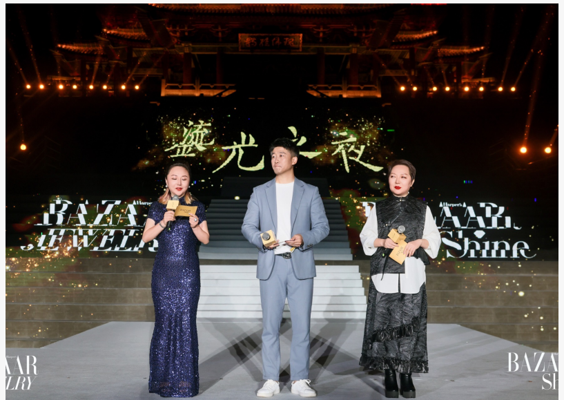
Nanchang International Fashion Week Concludes Perfectly, Bringing Fashion into Everyday Life

"To make one's steps shine brilliantly, one must tread a challenging path." The inaugural NCIFW concluded successfully under the