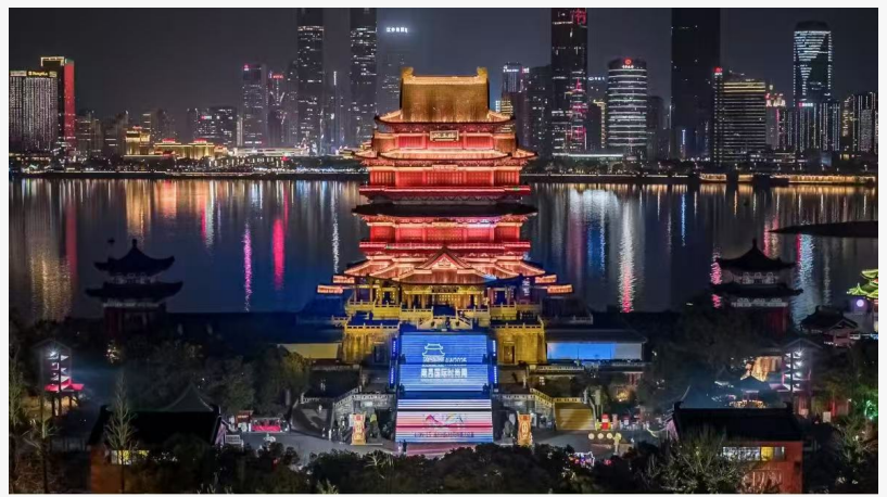
Nanchang International Fashion Week Concludes Perfectly, Bringing Fashion into Everyday Life

Tengwang Pavilion Outdoor Shows + Dual Satellite Venues Build a Universal Fashion Ecosystem Beyond the Tengwang Pavilion main venue, the Jiangxi Provincial Museum and Donghu Yiku Park