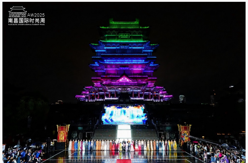
Nanchang International Fashion Week Concludes Perfectly, Bringing Fashion into Everyday Life