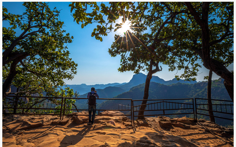
Sunset Splendor at Dhoopgarh – The Highest Peak of Satpura, Pachmarhi