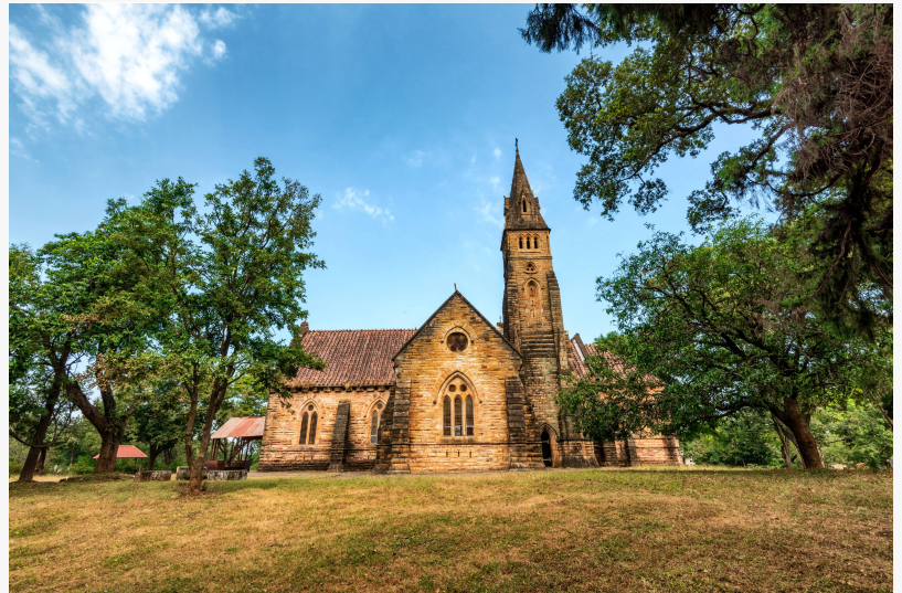
Christ Church Pachmarhi

Seasonal streams and waterfalls like Jharna emerge during this time, contributing to the quiet charm of the location. The setting, rich with architectural detail and historical associations, offers visitors a chance to