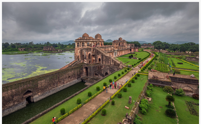
An Architectural Marvel Amidst Water: The Iconic Jahaz Mahal