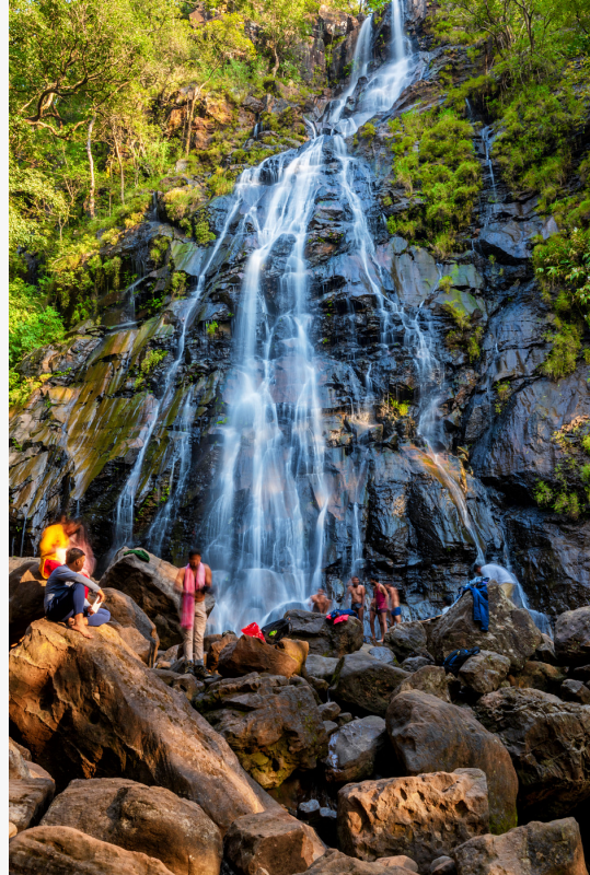
The Enchanting Bee Fall: Pachmarhi's Natural Gem

Ancient rock-cut formations like the Pandav Caves reflect local legends and mythological connections. Colonial-era landmarks, including the historic