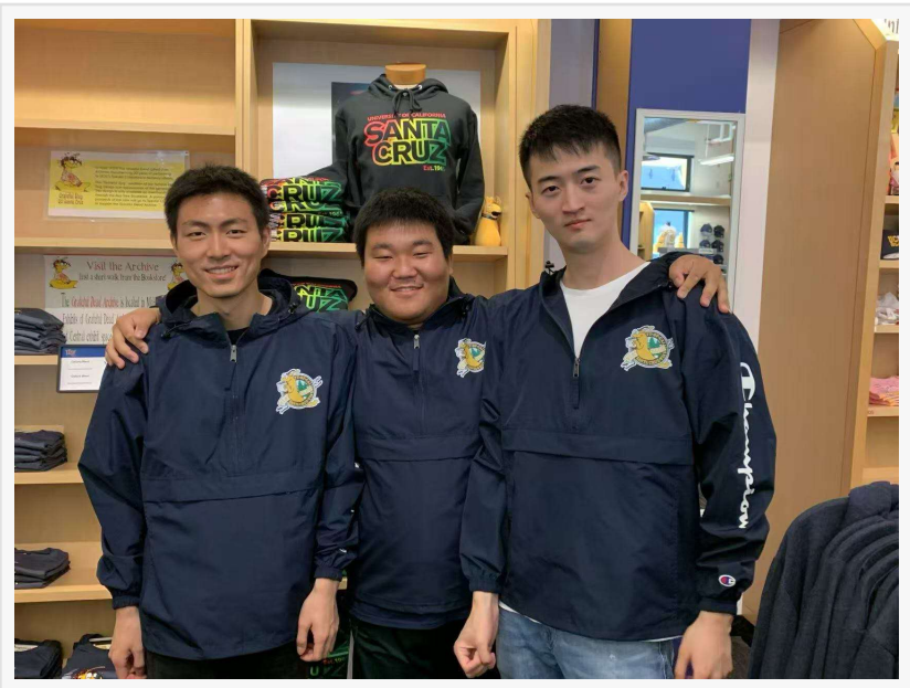
Founders of Aladdinmall.com

According to the U.S. Small Business Administration, over 33 million small businesses operate across the country, with more than 80 percent consisting of solo entrepreneurs. Many lack the time, technical resources, or funds to establish and maintain a digital presence.