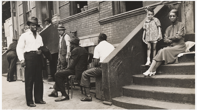
San Juan Hill: Manhattan's Lost Neighborhood