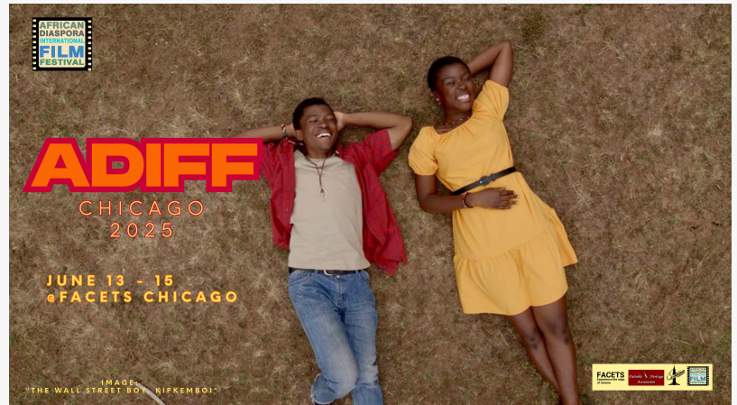
ADIFF Chicago 2025: June 13 - 15

CHICAGO, IL, UNITED STATES, May 27, 2025 /EINPresswire.com/ -- The African Diaspora International Film Festival ( ADIFF ) is proud to highlight the significant contributions of women filmmakers in its 22nd annual Chicago edition , taking place at FACETS Film Forum from June 13 to 15, 2025.