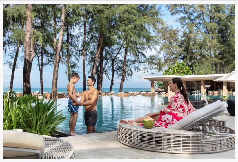
Beach Pool Lifestyle

Kids can unleash their creativity at Planet Trekkers, the dedicated kids' club, packed with daily activities that educate and entertain. Young ecoheroes can join Planet Guardian sessions, learning how to protect our planet through fun, hands-on activities.