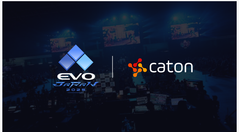
Caton Delivers Flawless Live IP Transmission for EVO Japan 2025

99.9999% reliability. Its AI-powered smart routing and automated path-switching capabilities ensured smooth, frame-accurate video without jitter, packet loss, or interruptions, while operating on public internet infrastructure. For content owners and broadcasters, this represents not only a leap in performance and significant operational savings compared to