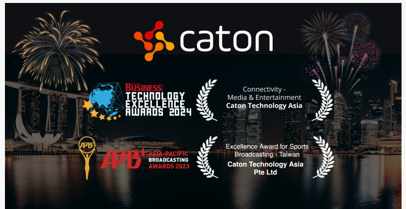
Caton Technology - Awards