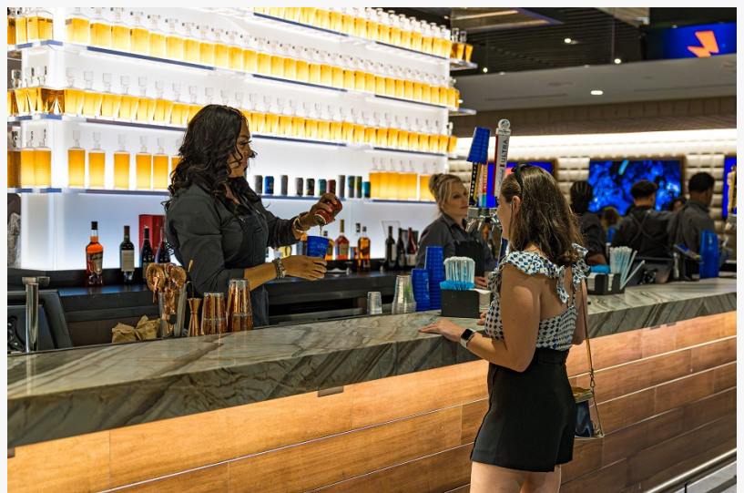
BEYOND Hospitality FIFA Club World Cup

thrilling, new format club football event – including venue fit-outs, menu taste tests, and match-day planning. The FIFA Club World Cup 2025™ features 32 of the world's top clubs and runs from 14 June to 13 July 2025, across 12 stadiums in the United States – providing loyal and new fans the opportunity to see the current greats of the game face off on home turf. See why "soccer" – with its electric pace and passionate fandom – remains the most popular sport on the planet,