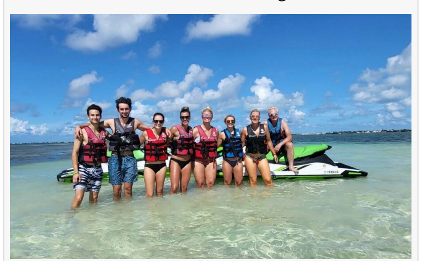
What better way to reset your mind then on the beach!

This press release can be viewed online at: https://www.einpresswire.com/article/816479467