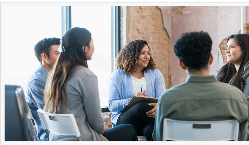
Clients in Group Counseling Session at Cornerstone of Southern California

Clients, alumni, and referring professionals can expect the same dedication to individualized treatment, clinical excellence, and a healing environment that fosters dignity and hope. Under Huseby's leadership, Cornerstone will continue to expand trauma-informed substance use disorder treatment services, mental