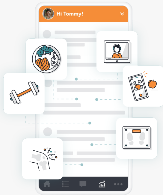
Prescribe FIT PACE Mobile App for Orthopedic Patients

Barrington Orthopedic Specialists remains committed to a holistic approach, ensuring that each patient receives the individualized support they need to achieve long-term success.