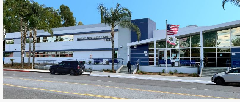
TTC Central Location in Tarzana

represents "a generational investment in California's behavioral health future. We are not just building facilities — we are building hope, dignity, and pathways to healing."