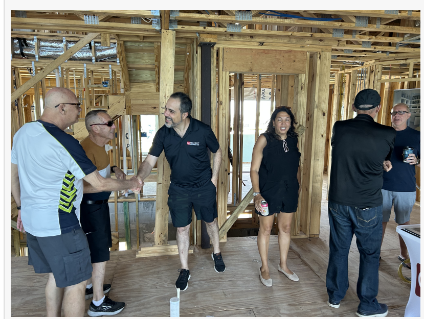
FineCraft meets with community members and industry professionals

design-build firm with a <u>reputation for excellence</u> in high-end construction projects, including kitchens, bathrooms, custom homes, and more. With over four decades of experience, we serve homeowners in Tampa Bay and DC Metro Regions. Our commitment to craftsmanship and client satisfaction ensures every project is a success, creating homes that bring families together in comfort and style.