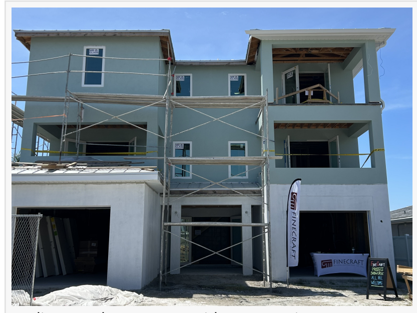
Redington Shore Home Mid Construction

REDINGTON SHORES, FL, UNITED STATES, May 28, 2025 /EINPresswire.com/ -- On Saturday May 24, FineCraft Contractors, a custom homebuilder with over 40 years of experience in the Tampa Bay and DC Metro markets, welcomed more than 30 guests to a successful Open House event at a <u>luxury coastal home</u> currently under construction in Redington Shores.