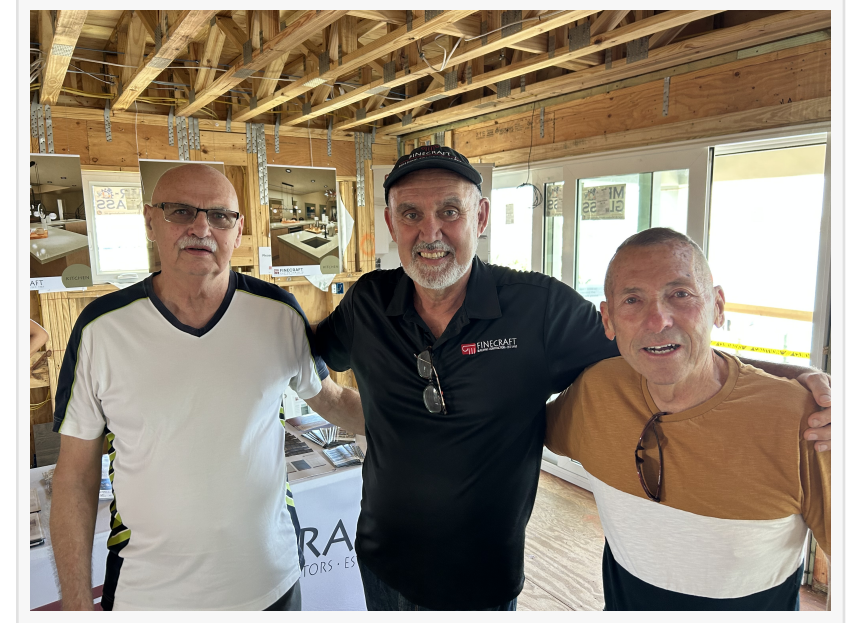
FineCraft President meeting with local homeowners