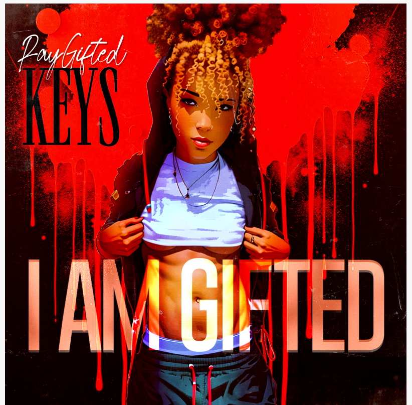
Official promotional artwork for Ray Gifted Keys' upcoming album "I Am Gifted," featuring the single "Wrong One."

This press release can be viewed online at: https://www.einpresswire.com/article/816698351