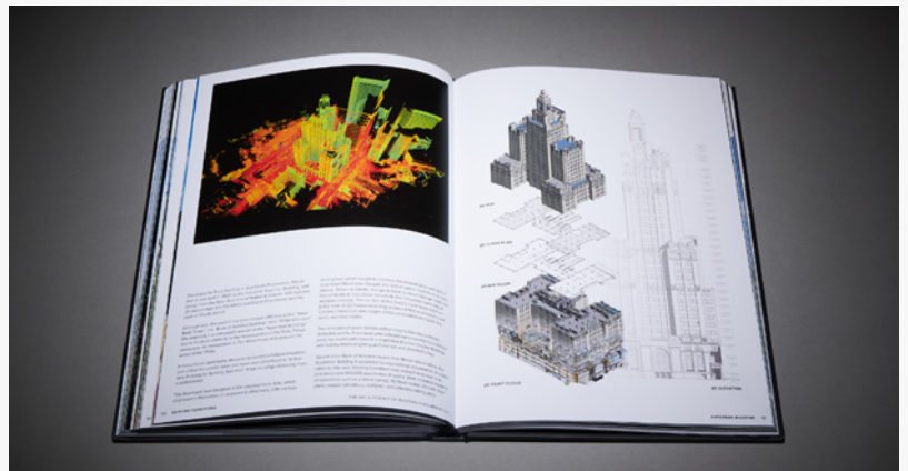
The Superman Building featured in "The Art & Science of Building Documentation".