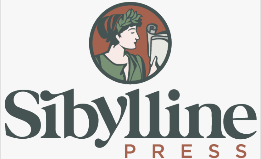
Sibylline Press Logo

Princesses Neve, Della, and Bry are sisters-in-law, having married into the royal Charming family, and for the last thirty-plus years, they've been living a coveted happily-ever-after life in the idyllic kingdom of Foreverness. But royal life isn't what it seems. Bry's people-pleasing is exhausting her, Della's exquisite and renowned beauty is fading with time, and Neve dreads the prospect of becoming queen one day, because power makes one a target, and she doesn't want to be killed ... again. Then the king's sudden death thrusts each princess into a