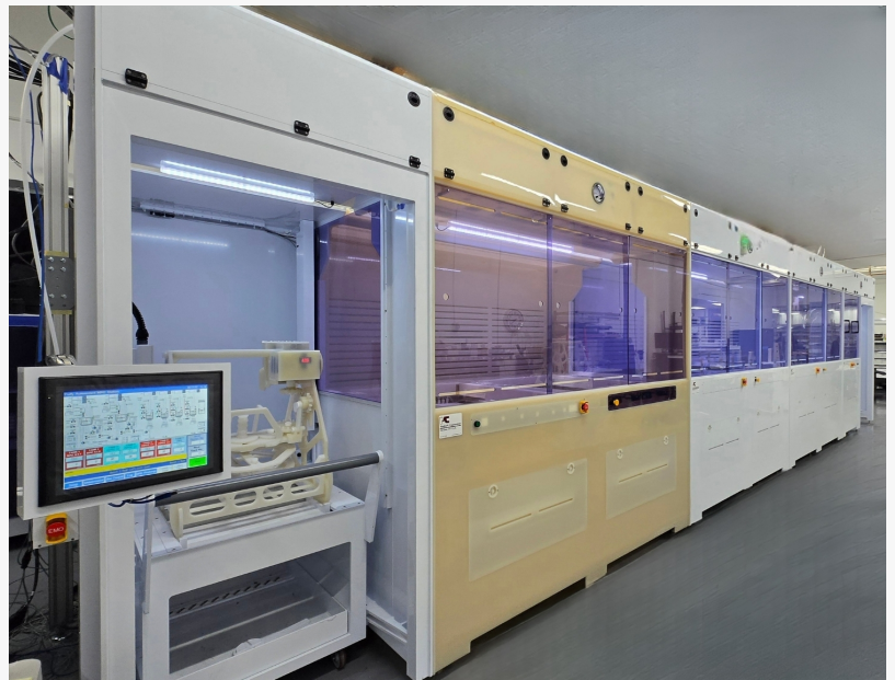
Automated Precision Parts Cleaning System

SAN JOSE, CA, UNITED STATES, May 29, 2025 /EINPresswire.com/ -- Modutek Corporation, a leading provider of manufacturing equipment and automated cleaning solutions, has successfully designed, built, and shipped its largest capacity Automated Precision Parts Cleaning System for a customer requiring high-efficiency, precision cleaning for complex components. This advanced system sets a new standard for both capacity and performance, reaffirming Modutek's commitment to delivering innovative solutions for industries demanding ultra-clean processing environments.