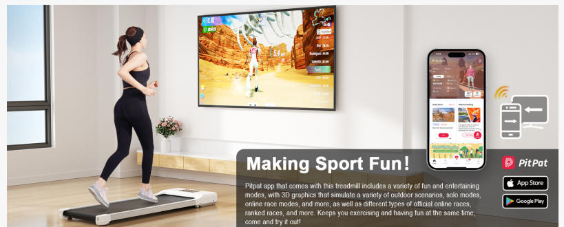
DeerRun & PitPat