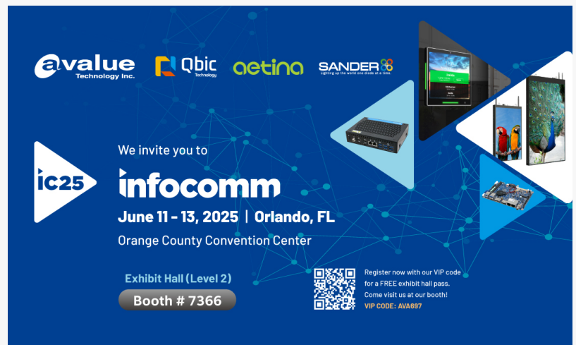
Avalue to Showcase Unified Pro AV and Edge AI Solutions at 2025 InfoComm