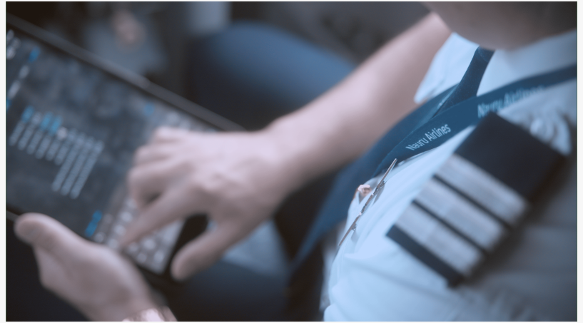
A Nauru Airlines crew manages flight operations on tablets with Ink